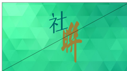
徽標擺放在圖案背景上

Placement of logo on gradient background